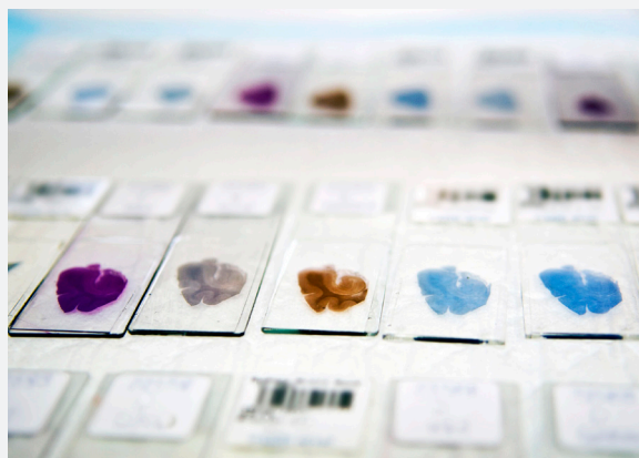
Special staining of sections of MSA brain to detect pathological changes associated with the disease

IT IS POSSIBLE THAT BOOSTING THE FUNCTION of COQ2 might combat the disease process of MSA. We will test whether treatment with coenzyme Q10, the product of the COQ2 gene, prevents or reduces alpha-synuclein aggregation in the brain, the dominant pathological hallmark of MSA. Using a cell model of MSA, we will measure the effects of different doses of coenzyme Q10 on alpha-synuclein production and aggregation. We expect that coenzyme Q10 treatment will prevent or reduce alpha-synuclein aggregation in oligodendrocytes by ameliorating the levels of ATP and of other molecules known to be involved in MSA pathogenesis. If this approach is successful, we will begin initial therapeutic treatment studies using animal models of MSA.